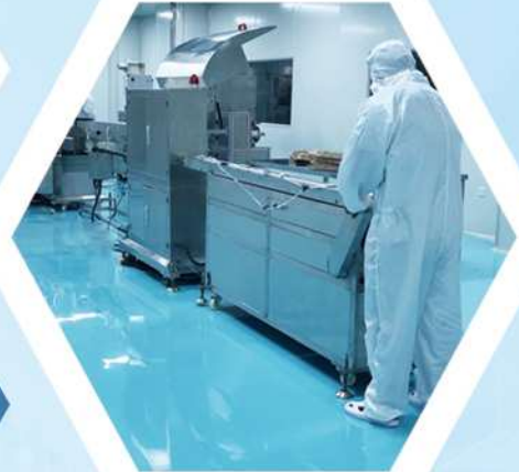
100,000-Level Clean Workshop 100-Level Purification Area