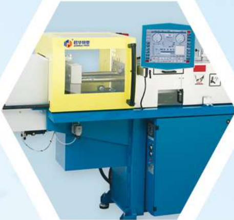
Micro Precision Injection Molding Machine Imported From Germany